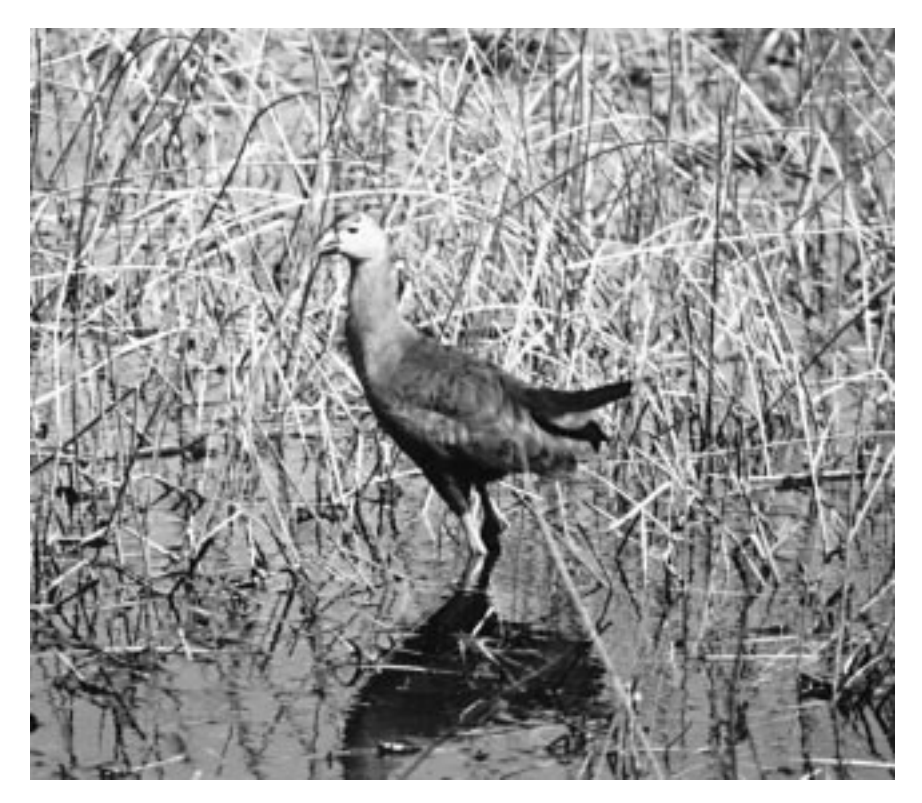
Figure 1. Adult Purple Swamphen at Pembroke Pines, Florida. Photographed by Bill Pranty, 9 October 1998.

Swamphens are large rallids that resemble Purple Gallinules ( Porphyrula martinica ) in shape and color (especially the races P. p. madagascariensis , poliocephalus and viridus ). However, swamphens have body lengths about 50% larger and wingspans nearly twice as long as those of gallinules (45-50 and 90-100 cm vs. 30-36 and 50-55 cm, respectively; Beaman and Madge 1998). Purple Swamphens have large red bills and frontal shields, red irides, orange legs and toes, usually with blackish areas at the heel and toe joints, white undertail coverts, and bodies that are pale blue, brilliant blue, purplish, or blackish. Australian birds are darkest, with blackish wings and backs, Phillipine birds are the palest and have rusty backs, and African birds have greenish backs. Juvenal plumage likewise varies, but is characterized by dull plumage and a dusky bill and frontal shield (del Hoyo et al. 1996, Beaman and Madge 1998).