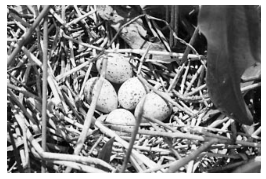
Figure 3. First documented Purple Swamphen nest in North America, at Pembroke Pines, Florida, 25 July 1999.

The current range of the Purple Swamphen in Pembroke Pines, Florida, is apparently bounded by Sheridan Street to the north, 600 m